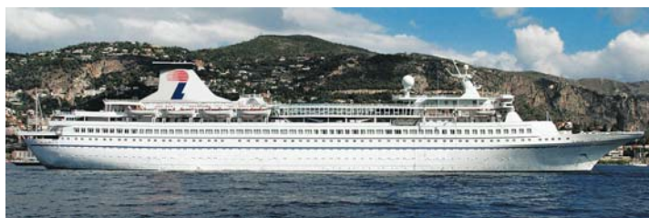
Aquamarine Louis Cruise Lines

Tonnage ..... 25611 Total Outside Staterooms ..... 317 Total Inside Staterooms ..... 163 Total Staterooms ..... 480 Crew Members..... 388