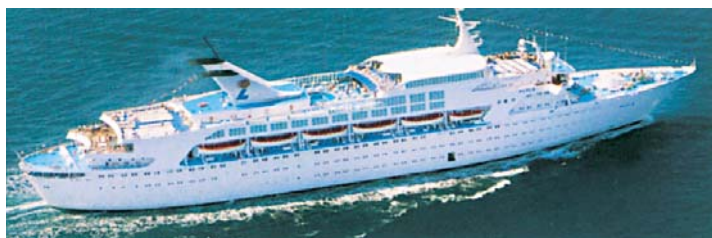
Perla Louis Cruise Lines

Tonnage ..... 23144 Total Outside Staterooms ..... 339 Total Inside Staterooms ..... 186 Total Staterooms ..... 525 Crew Members..... 388