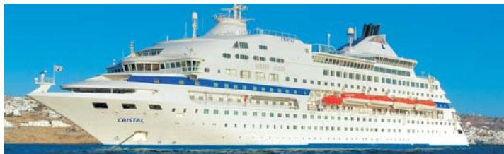
Cristal Louis Cruise Lines

Greek Officers and European crews, with their friendly gracious hospitality and nautical tradition topped with a superb cuisine, will offer you an unforgettable cruise experience to the Greek Islands and beyond. You will be tempted by the variety of on board facilities, ship board entertainment options and activities organized by the cruise staff. Your days and nights on board can be as active or as quiet and laid back as you please.